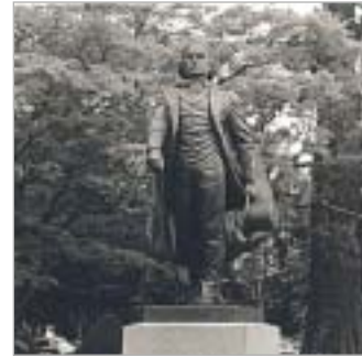
Dr. John McLoughlin