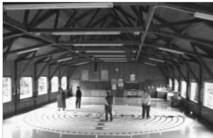
Several people "walk into the new year" on the indoor labyrinth at Camp Magruder.